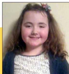
From Isla aged 8

will be on your side and expect more of me too. I worry about what you are going to tell us to do next. I think you should care more about the children who come to see you and try to understand what they are going through.