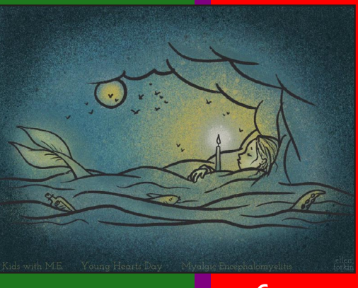
Can you spot your candle here?